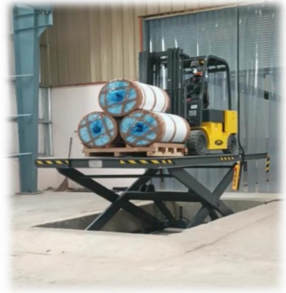
Pit Mounted Hydraulic Scissor Lift