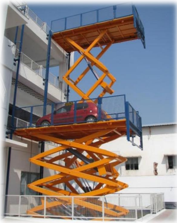
Hydraulic Car Scissor Lift