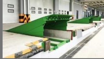
Hydraulic Dock Leveler