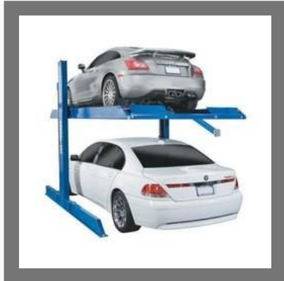
Car Parking Lift