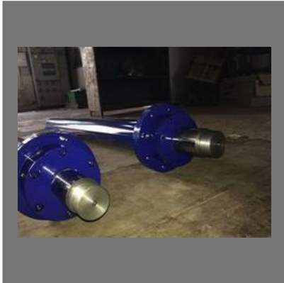
Double Acting Hydraulic Cylinder