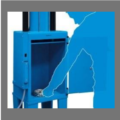
Oil Drum And Paint Bucket Crusher