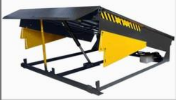
Hydraulic Type Dock Levelers