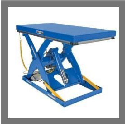
Hydraulic Tilt Scissor Lift Table