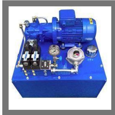
Hydraulic Power Pack