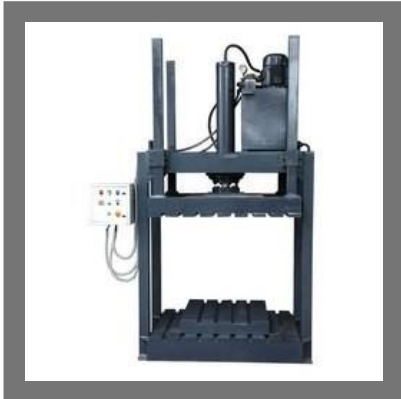
Hydraulic Paper Baling Press