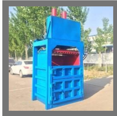
Tyre Baling Press