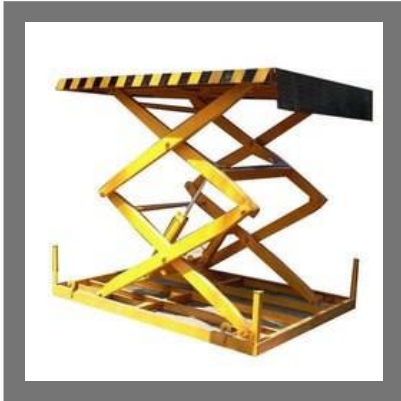
Hydraulic Scissor Lift