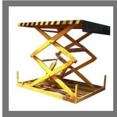
Double Hydraulic Scissor Lift