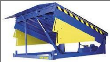
Warehouse Dock Leveler