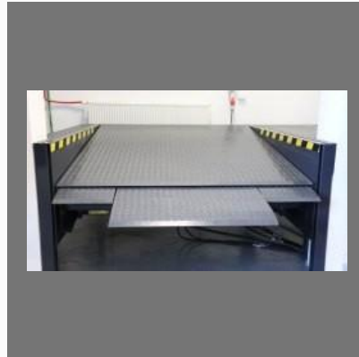
Telescopic Lip Dock Level