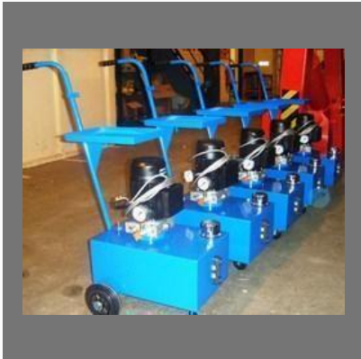
Portable Hydraulic Power Pack