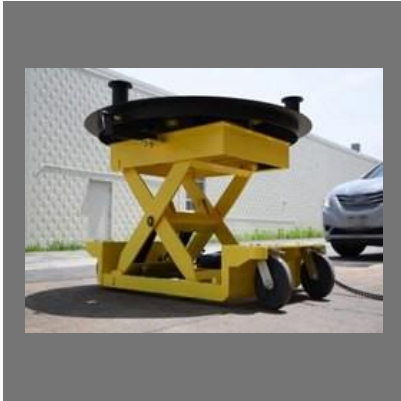
Rotary Platform Scissor Lift Table