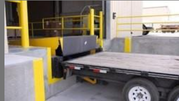
Radius Lip Dock Levelers