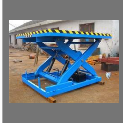
Hydraulic Single Scissor Lift