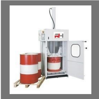
Hydraulic Drum Crusher