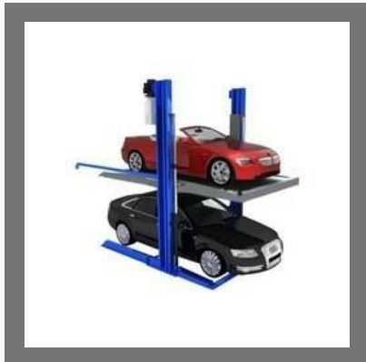
Hydraulic Car Lift