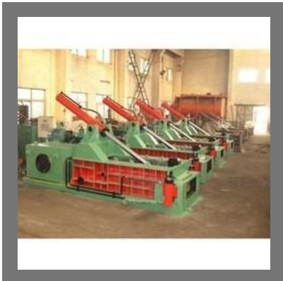
Hydraulic Scrap Baling Press