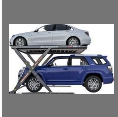
2 Post Car Parking Lift