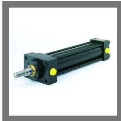
High Pressure Hydraulic Cylinders