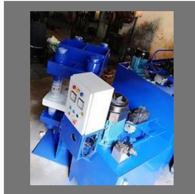
Hydraulic SPM Power Pack