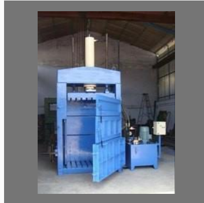
Hydraulic Coir Fiber Balers