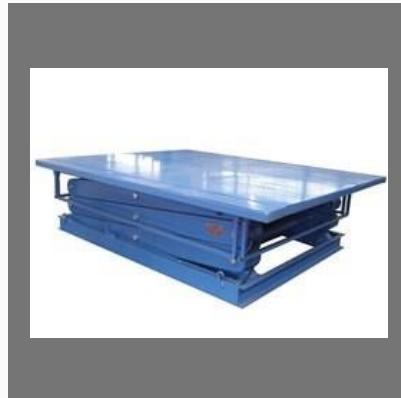
Hydraulic Car Scissor Lift