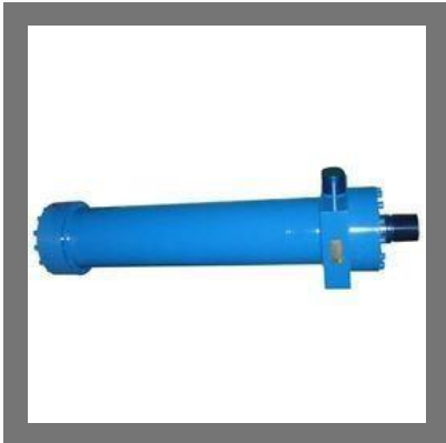
Welded Hydraulic Cylinder