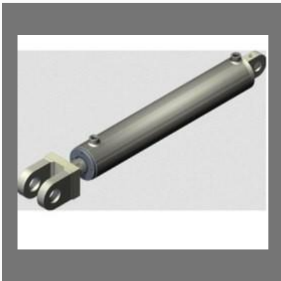
Industrial Hydraulic Cylinders