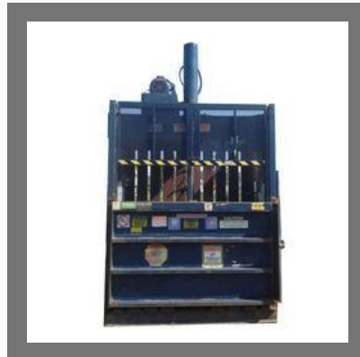
Down Stroke Baler