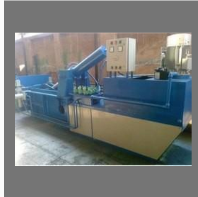
Hydraulic Scrap Baling Press