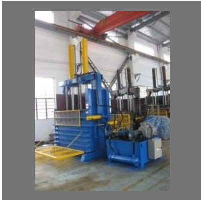
Heavy Duty Tyre Baler