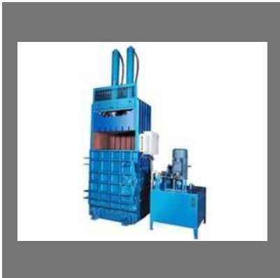
Hydraulic PET Bottle Balers