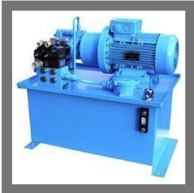
Heavy Duty Hydraulic Power Pack